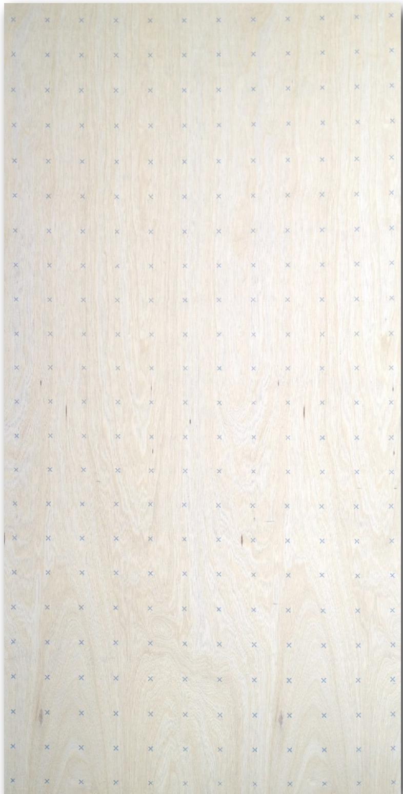
Typical Face (4' x 8')