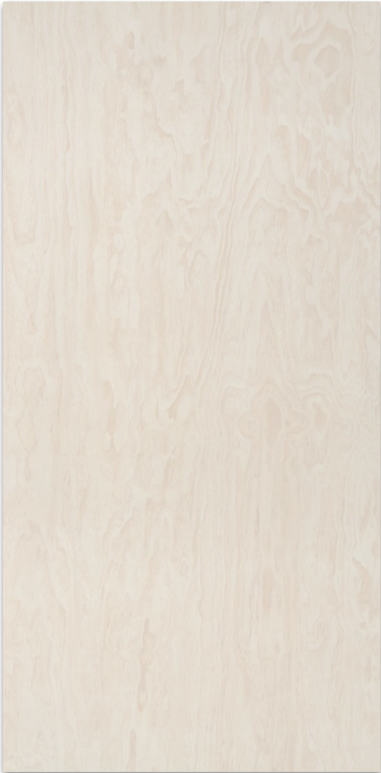
Typical Back (4' x 8')